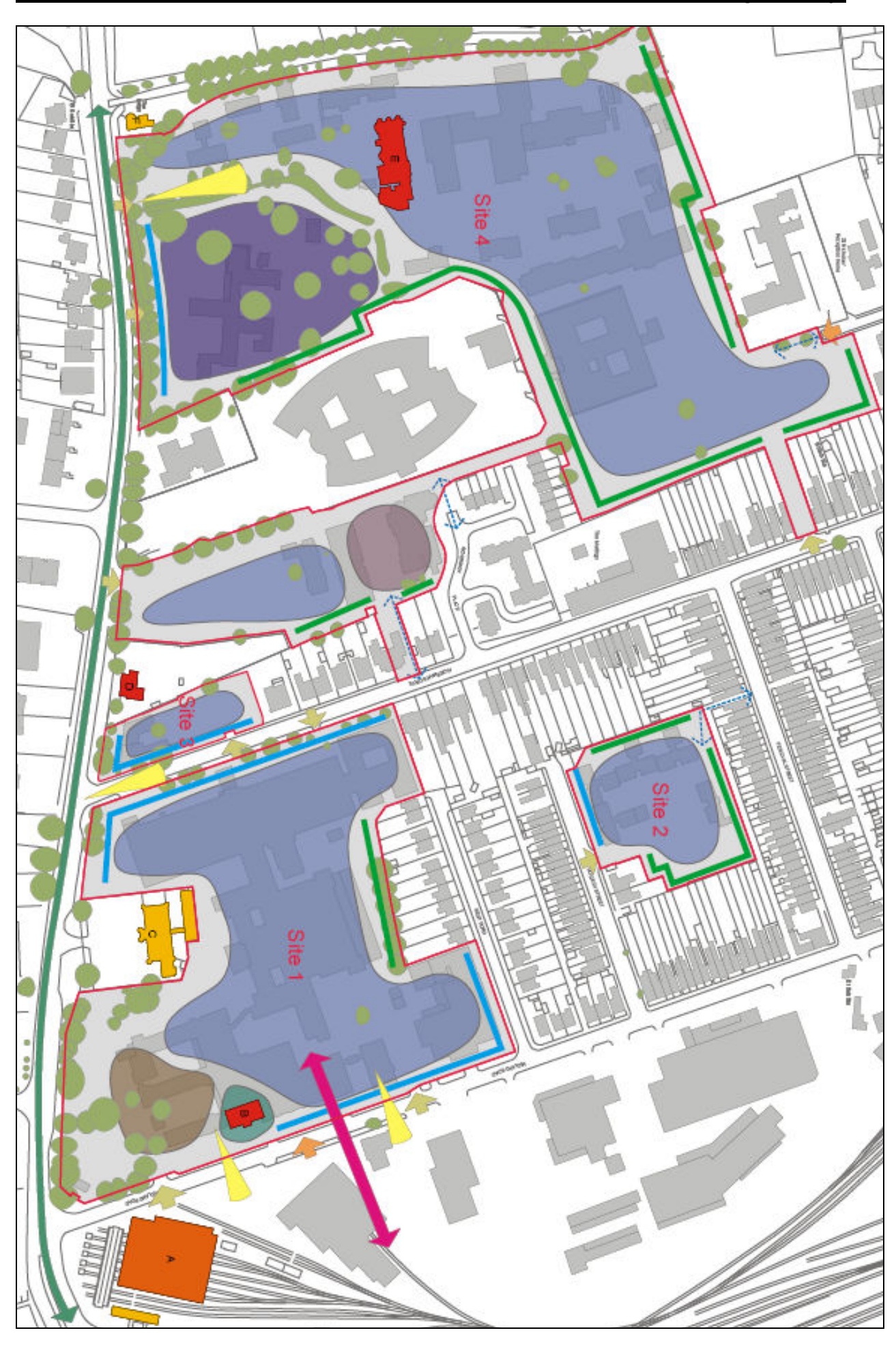
Appendix 1 – Hospital Site - Constraints and Opportunities Map (see next page for Key)